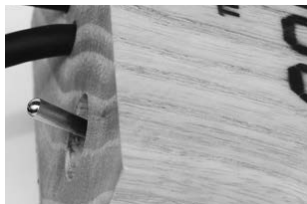
phase correction „off“ (up)

For four new measurements you will have to tap five times: e.g. "1" - measurement - "2" - measurement - "3" - measurement - "4" - measurement - "1".